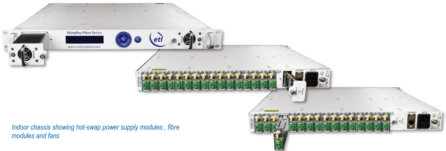
Indoor chassis showing hot-swap power supply modules , fibre modules and fans